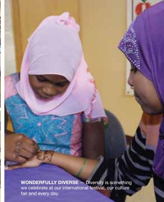
WONDERFULLY DIVERSE — Diversity is something we celebrate at our international festival, our culture fair and every day.